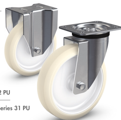
Series 32 PU