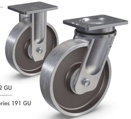
Series 192 GU