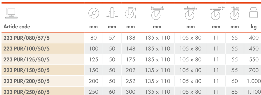
Series 223 PUR