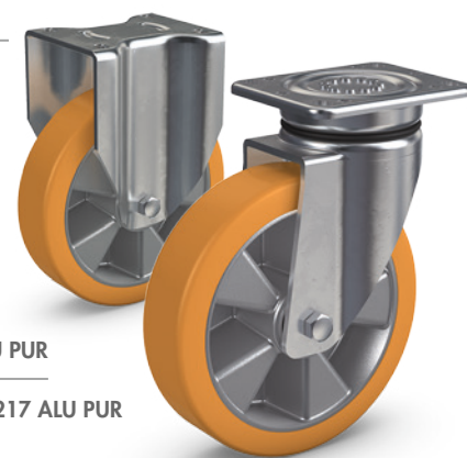
Series 218 ALU PUR